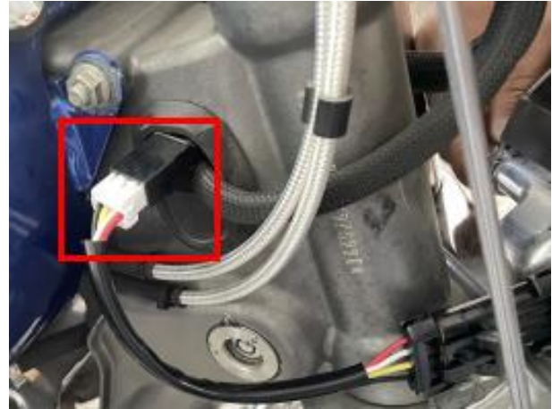
4. Installation finished.