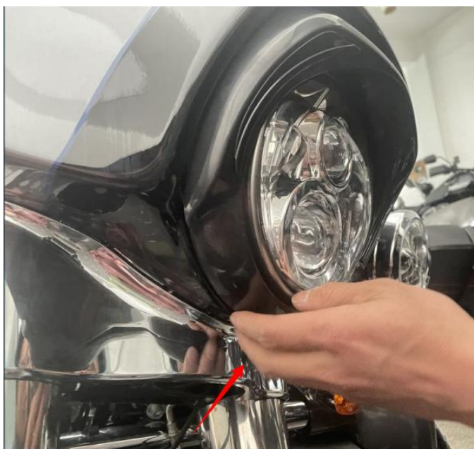
4. Installation finished.