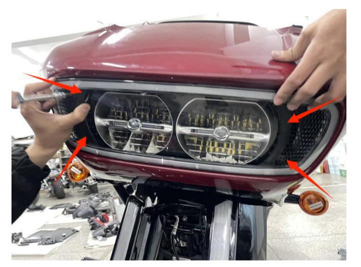
4. Make sure there is no error and then use the matching self-tapping screws to fix the light on the fairing, and finally install the windshield and other accessories back. As the picture shows: