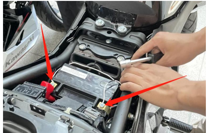
4. Installation finished.