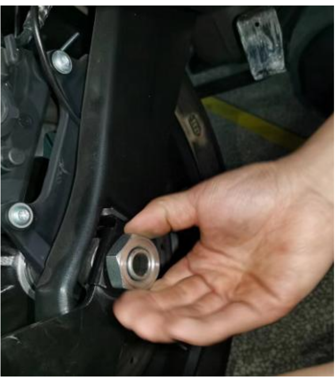
3. Rear wheel fende on the frame as shown in the figure. Installation complete .