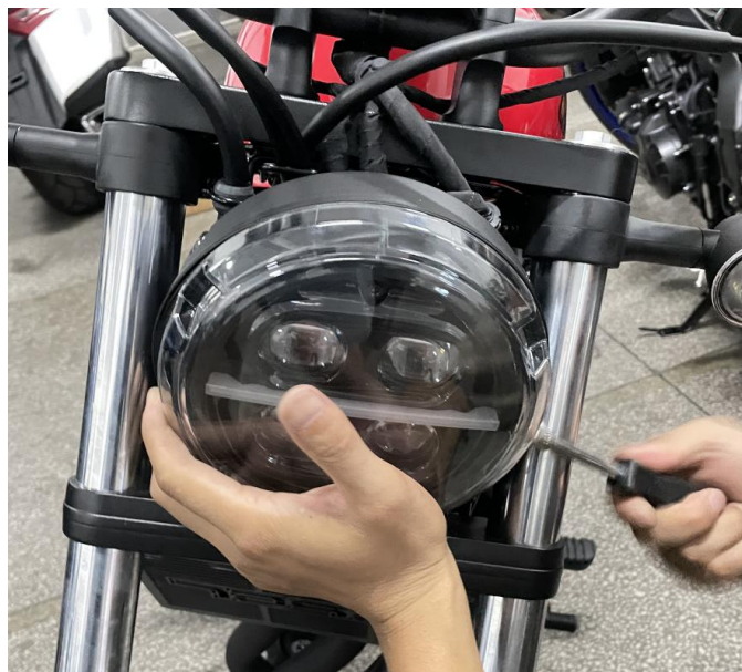
4. Installation finished.