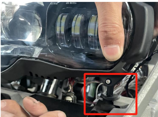
5. Installation finished.

4. After connecting the wiring harness, start the motorcycle and turn on the headlight switch to check if the low and high beams of the headlights are on. After confirming that they are correct, use the original motorcycle screws to fix the headlights and the previously removed decorative parts. As the picture shows: