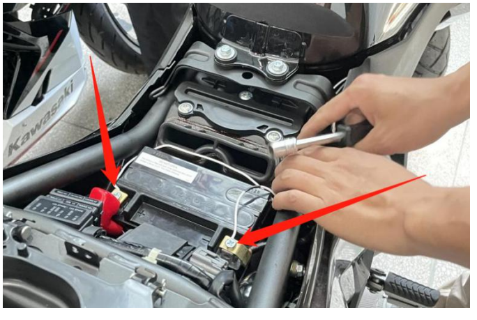
4. Installation finished.